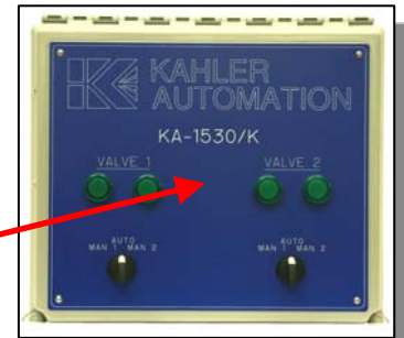
TWO WAY VALVES: Alley way Light Display Panel shows the loader operator the Two Way Valve locations.