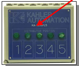
LEG (UPPER) DISTRIBUTOR: Alley way Light Display Panel shows the loader operator the Distributor location.