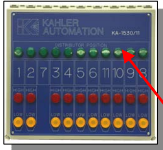
BLEND TOWER DISTRIBUTOR: Alley way Light Display Panel shows the loader operator the Distributor location.

The KA115 is a wireless control system that will allow the loader operator to move the distributors, or two way valves to the proper location from the loader. A simple touch of the selected button will signal the system to move the selected distributor.