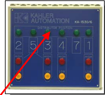
WHOLESALE TOWER DISTRIBUTOR: Alley way Light Display Panel shows the loader operator the Distributor location.

The KA115 is a wireless control system that will allow the loader operator to move the distributors, or two way valves to the proper location from the loader. A simple touch of the selected button will signal the system to move the selected distributor.