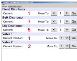
A Computer Graphics program is also available to switch or monitor the Distributor location from the office PC.