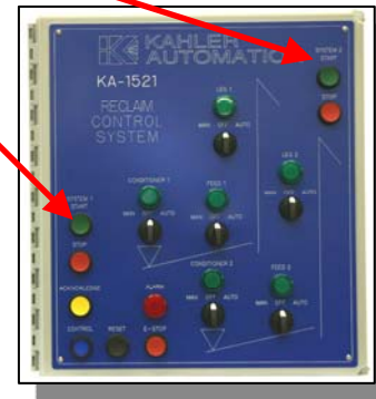
RECLAIM CONVEYORS & LEGS: The KA115 system allows the loader operator to start/stop each Reclaim Leg, Drag Conveyor and Conditioner..

KA115 Wireless Panel control works with the above panels to allow the loader operator maximum utilization of his time during the bin filling process.