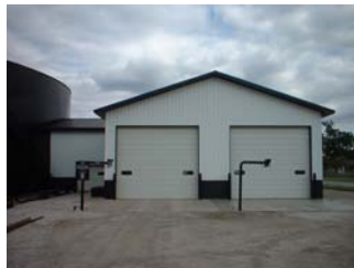
Overhead Door Control Systems

Touch Screen Models are also available with the multi language feature as the security system for the facility. The driver is given access to the facility with the text of his choice for easy, convenient operation of the Unstaffed facility.