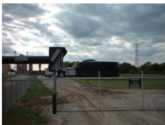
Gate Control Systems